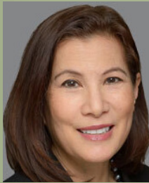
Chief Justice Tani Cantil-Sakauye

12:00 pm – 1:45 pm Annual Luncheon with Keynote Speaker: Grand Ballroom Former Chief Justice of the Supreme Court of California