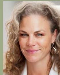
Monique McNeill Casetext