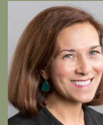
Hon. Ann-Christine Massullo San Francisco County Superior Court