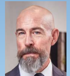
Miles Cooper Coopers LLP